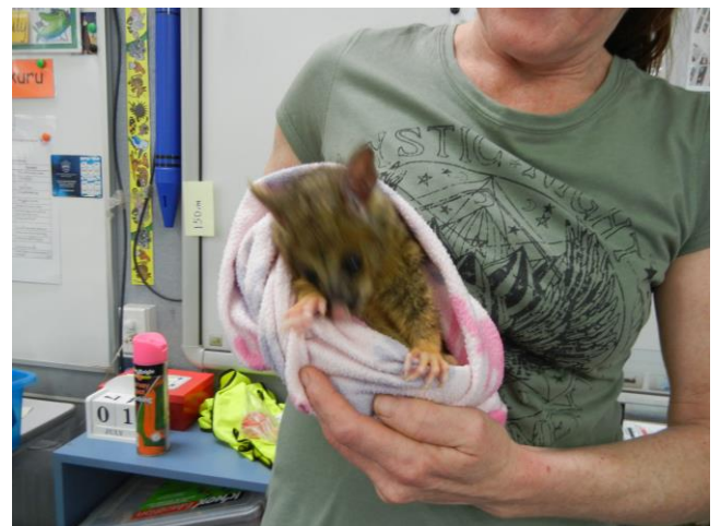
The delightful Ringtail Possum joey.