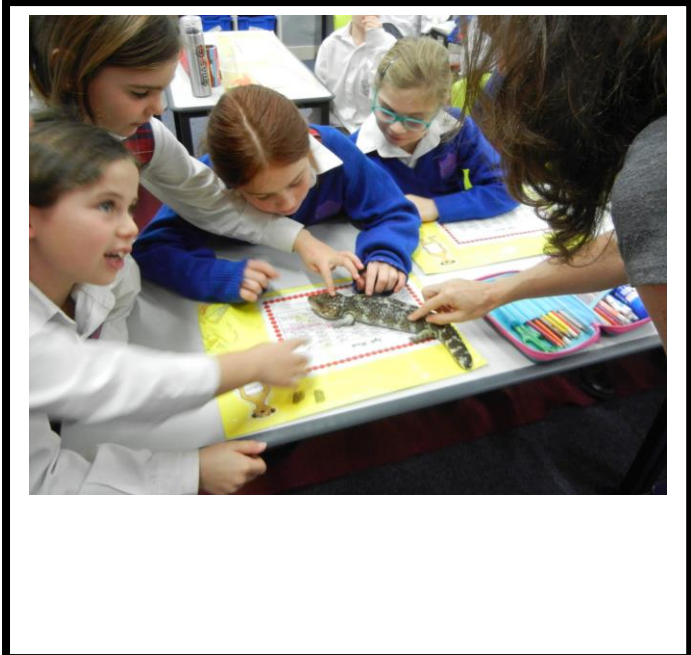
We got to touch a Blue Tongue Lizard.