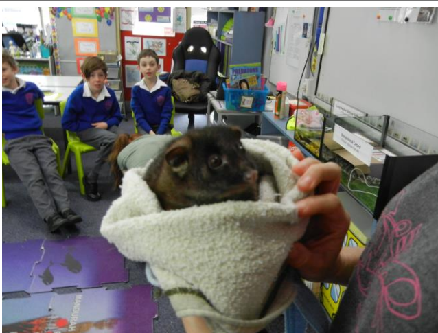
A beautiful Brushtail Possum joey.,

On Wednesday 1 st July we were very lucky to have Bec and Lynda come in and show us some beautiful native animals.