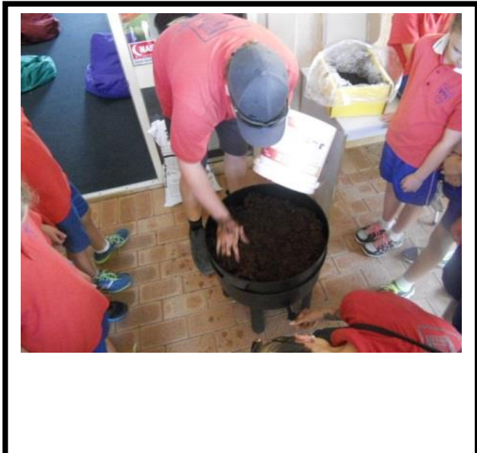
Next we made a potting mix layer.