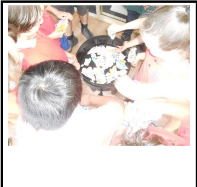
After setting up the farm we shredded cardboard to put on the