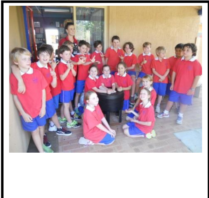
Now we have to look after them!