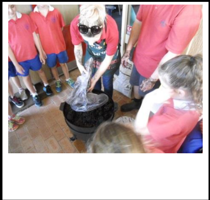
Next were the worms.