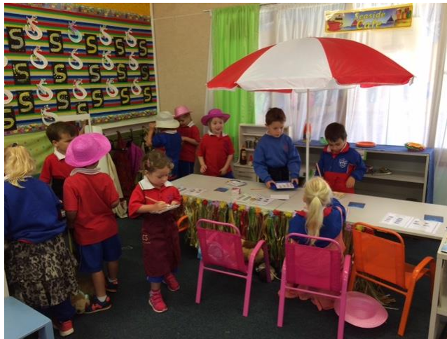
Dramatic play - Café in Kindy