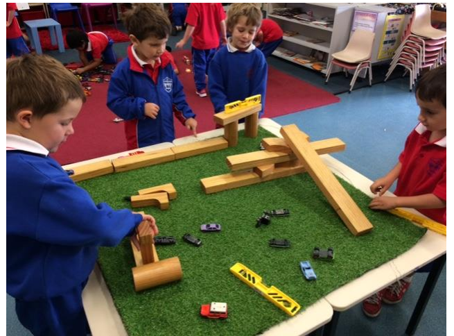
Manipulatives - It looks like I'm playing, but I'm developing motor skills, math concepts (number, size, shape, space), oral language, social skills, eye-hand coordination, and my imagination.