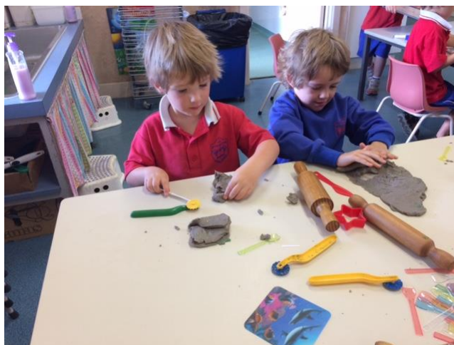
Play dough fun.